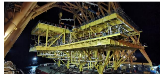
VB-10000 INSTALLING A PLATFORM IN MEXICO

CAPACITIES ARE IN SHORT TONS SPECIFICATIONS ARE SUBJECT TO CHANGE WITHOUT NOTICE