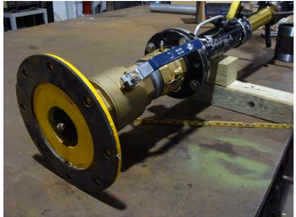
HOT TAP FITTED TO 3" FLANGE