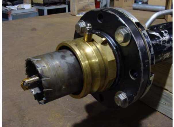
2.5" BIT WITH PILOT BIT