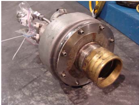
HYDRAULIC PUMP FITTED TO FLANGE

VARIES DEPENDING ON PRODUCT AND DISCHARGE NEEDED